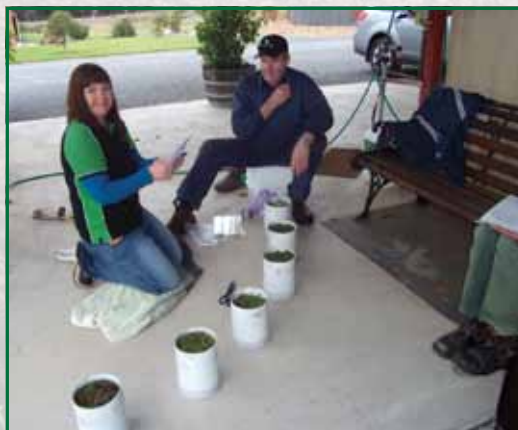
Preparing 6 core samples under DPI supervision. 3 x controls and 3 NutriSoil treated repetitions.